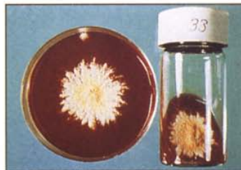
Microsporum gypseum at 14 days.